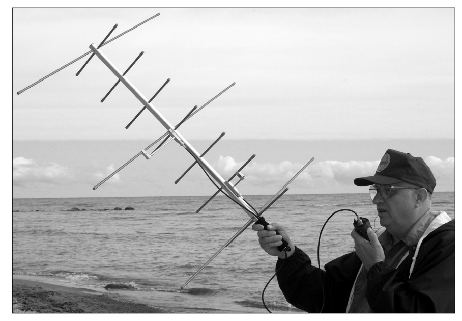
The author uses a Kenwood TH-78A dual-band HT and a lightweight Arrow Antenna to make a contact through AO-51 from the shores of Lake Huron in Michigan. When used with a 5 watt, full-duplex handheld in an open location free of foliage, such as a beach or a field, the antenna provides enough uplink and downlink gain to successfully work the FM birds, even on passes close to the horizon.

To listen for, or communicate through, an Amateur Radio satellite you first have to find out when it will be within range of your