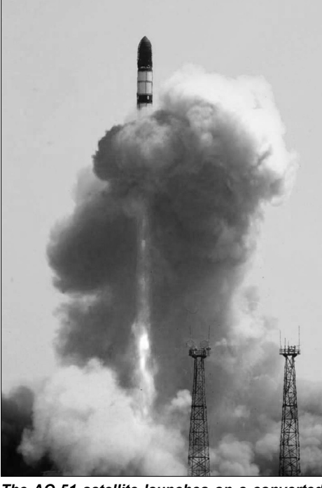
The AO-51 satellite launches on a converted Russian ICBM rocket on 29 June, 2004 from the Baikonour Launch Complex in Kazakhstan.

You will also note that AO-51's satellite passes at your location follow a repeating